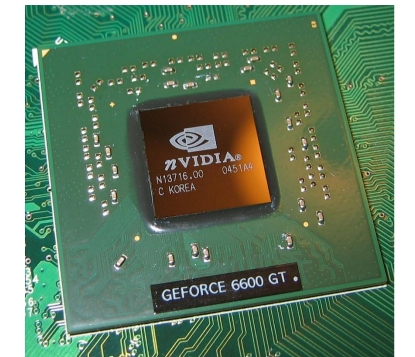
NVIDIA GEFORCE 6600GT GPU

General-Purpose computing on Graphics Processing Units (GPGPU) is a technique of using a graphics processing units (GPU) to handle computation in applications traditionally handled by CPU. It is a popular approach that uses parallelization to speed up computation tasks.