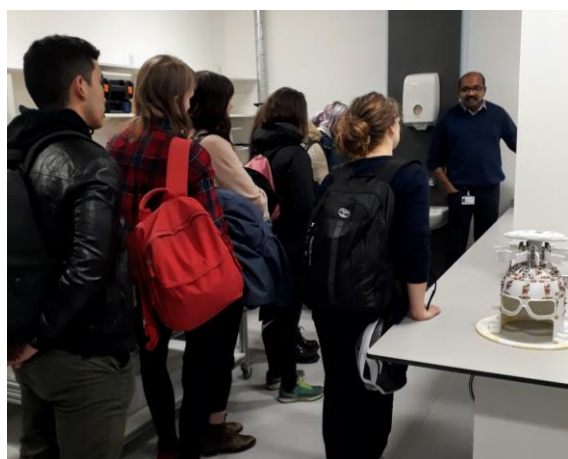
SINAPSE arranged for Biomedical Engineering undergraduate students to visit ICE in Glasgow, including its MRI coil laboratory