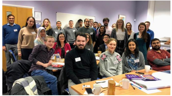
A SINAPSE welcome event in December 2018 brought together PhD students beginning imaging research projects across Scotland

Nevertheless, we have been delighted to continue supporting PhD students commencing their imaging research training at Scottish Universities. This year SINAPSE organised two welcome events: at Dundee in February, for students who started in 2017, and at Stirling in December, for students who started in 2018. Feedback has been very positive on these opportunities for early-stage students to feel part of a structured cohort, despite belonging to different PhD programmes at different institutions.