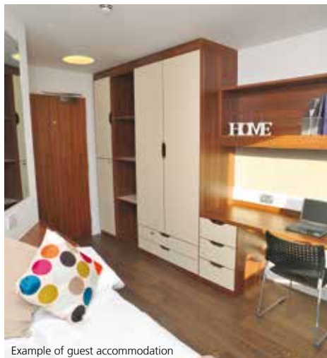
Example of guest accommodation

Check in is from 3pm on date of arrival and check out is by 10am on day of departure.